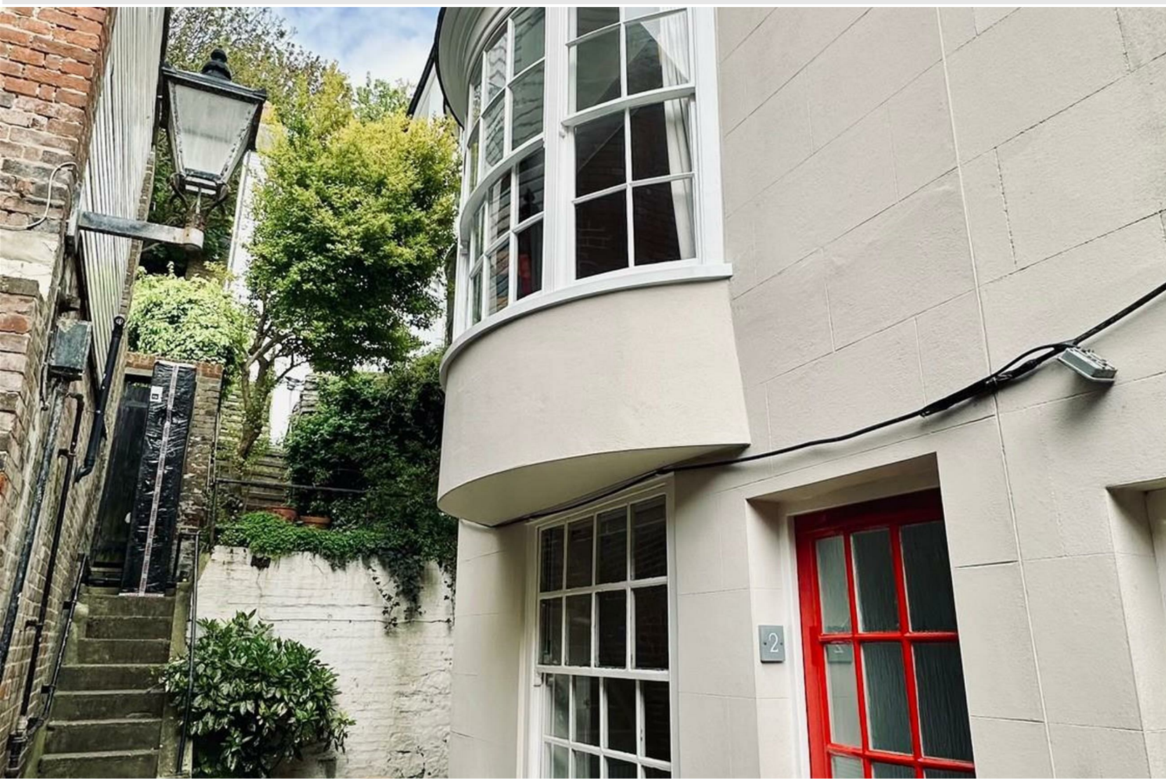
2 Burdett Place, Old Town, Hastings, TN34 3ED