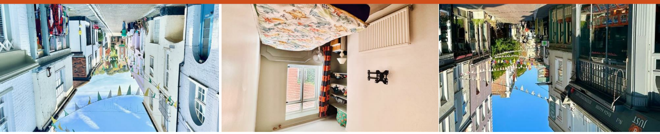
2 Burdett Place, Old Town, Hastings, TN34 3ED